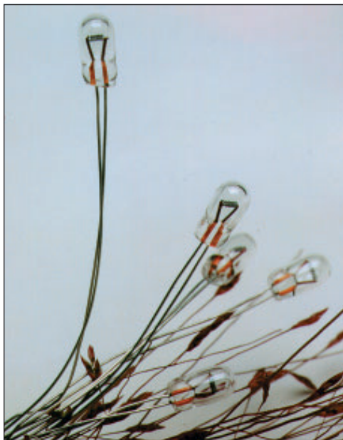
Straight Double Coiled CC-6 Filament